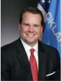
Oklahoma Lt. Governor Todd Lamb