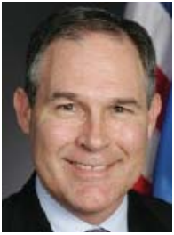
Scott Pruitt Oklahoma Attorney General